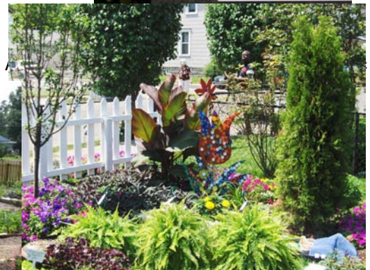
(r to l), Christ the King Community Garden and Franklin Park Conservatory