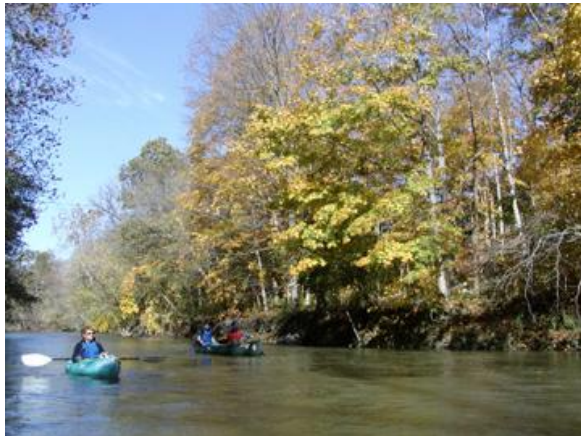
Boaters enjoy a warm fall day on Alum Creek near Mock Park

The goal of the plan is to comprehensively address water quality problems in Alum Creek, protect areas that are currently in good ecological health, and incorporate the community’s vision for increasing the creek’s value as a local amenity. Creating boat access to facilitate trips like the one pictured below is just one example of a project that will increase the creek’s recreational use. Other projects will address sources of urban runoff pollution, physical impairments to stream habitat, and building awareness of the creek and pollution issues.